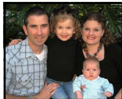
Family of 4!

We feel like we have already been "everywhere," just in the last few months of itineration! Since the last newsletter, we've traveled over 15,000 miles through 7 different states!!! Thank you for your prayers for our traveling safety. We definitely feel covered by God's grace, as we have seen God save us from several dangerous instances on the road!